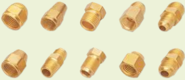
Brass Flare Fittings