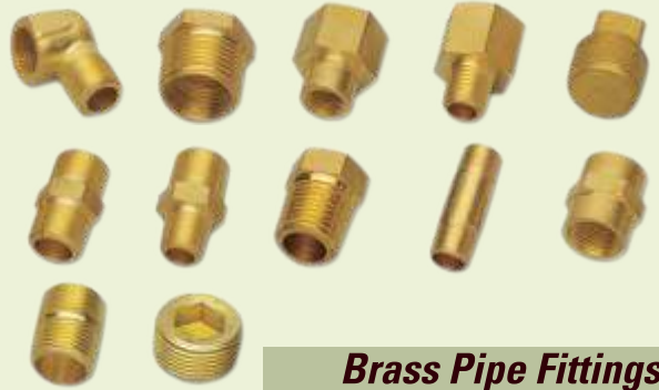
Brass Pipe Fittings