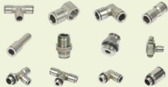
Brass Pneumatic Fittings