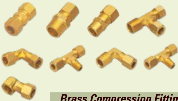
Brass Compression Fittings